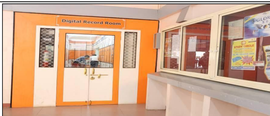
Digital Record Room