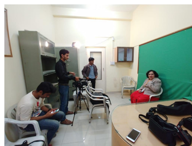
E-Content Development Cell