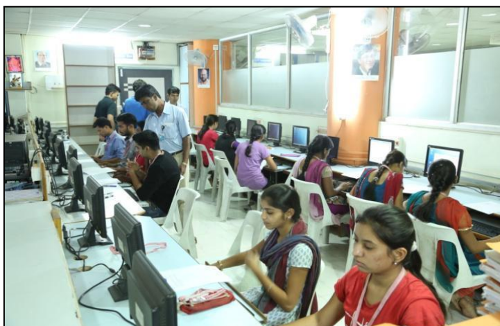
Computer Science Laboratory