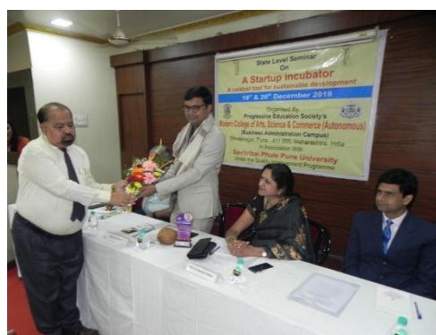
Study Visit and State level seminar organized by the Department