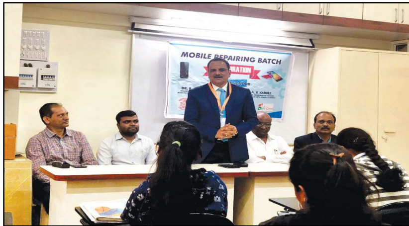
Department of Commerce: Skill development course on mobile repairing for Undergraduate students

Syllabus : Visit following link for detailed syllabus http://moderncollegepune.edu.in/wp-content/uploads/2020/02/Mcom-syllabus.pdf