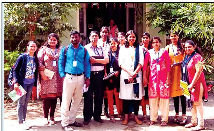
Department of Marathi Study visit of Post Graduate Students Bhandarkar Oriental Research Institute, Pune.