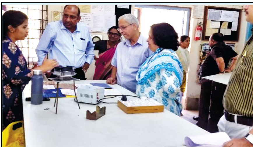
Dept. of Physics: Project Exhibition and competition