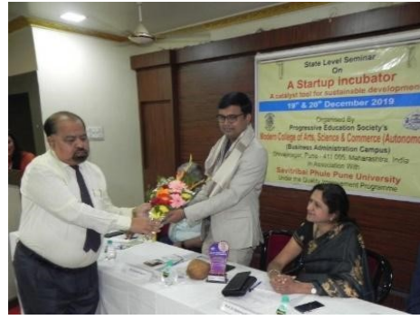
Study Visit and State level seminar organized by the Department