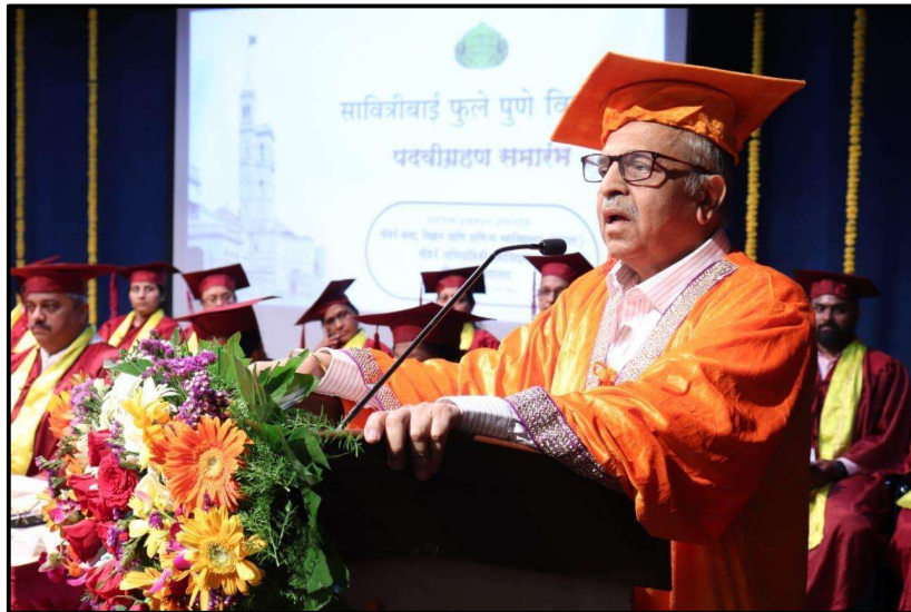
‘Graduation Ceremony’ held at college auditorium

Syllabus : Visit following link for detailed syllabus http://moderncollegepune.edu.in/wp-content/uploads/2020/02/Mcom-e-commerce-detailed-syllabus.pdf