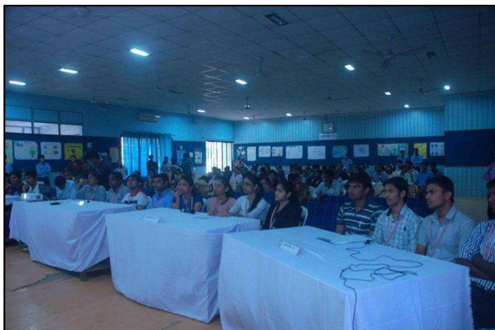
Department of Computer Science: Intercollegiate Quiz Contest