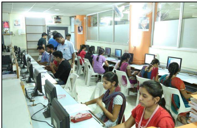
Computer Science Laboratory