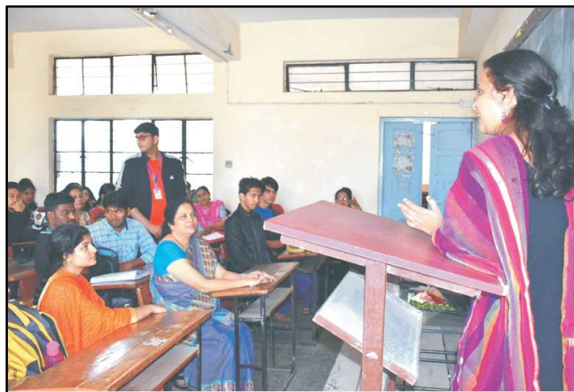
Guest Lecture for Postgraduate English Batch