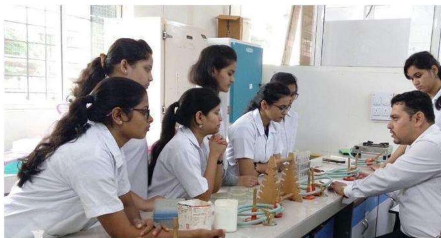
Department of Microbiology: Hands-on-training for UG students

Syllabus : Visit following link for detailed syllabus http://moderncollegepune.edu.in/wp-content/uploads/2020/02/PG-MSc-Microbiology-Part-I-Proposed-Detailed-Syllabus-AY2019-20.pdf