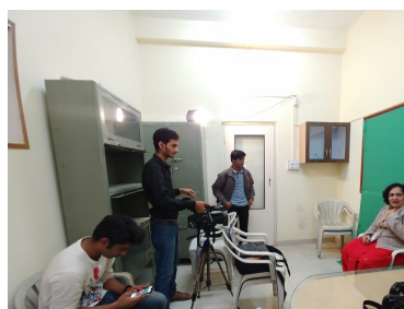
E-Content Development Cell