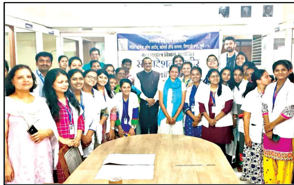
Department of Psychology: Counselling Camp

Syllabus : Visit following link for detailed syllabus http://moderncollegepune.edu.in/wp-content/uploads/2020/02/MA_Psy_Syllabus2019.pdf