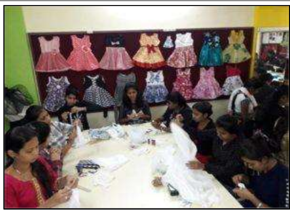
Fashion Technology : Classroom Activity