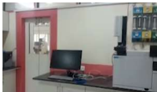
Central Sophisticated Analytical Instrumentation Facility