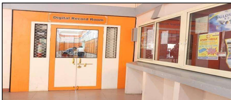
Digital Record Room