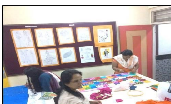
Fashion Technology : Classroom Activity