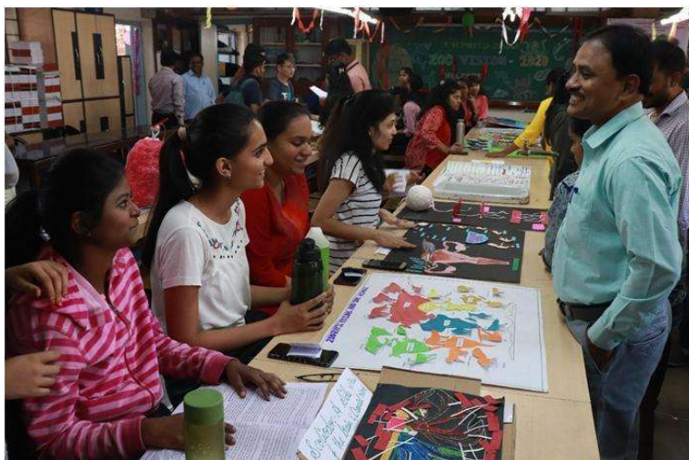
Department of Zoology: Zoo Vision 2020: Poster and Model- Exhibition cum Competition