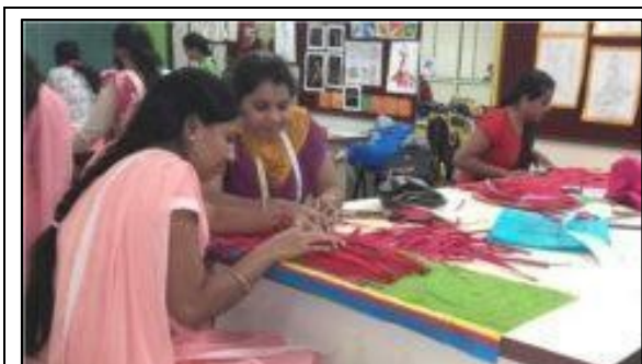
Fashion Technology :origami workshop