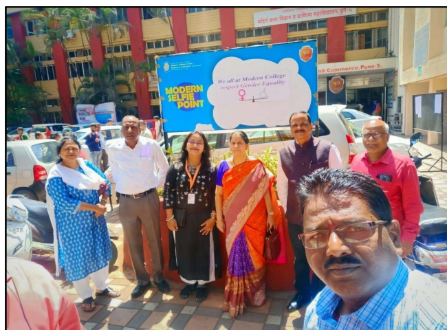
“Selfie point” to create social and environmental awareness among students