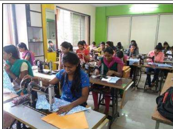
Fashion Technology : Workshop