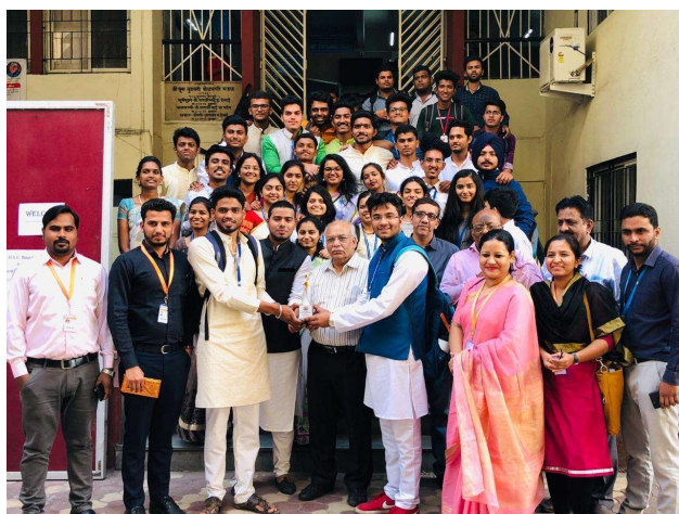
First prize to the Department at intercollegiate Mock Parliament Trophy competition organized by H. V. Desai College