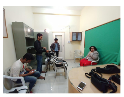
E-Content Development Cell