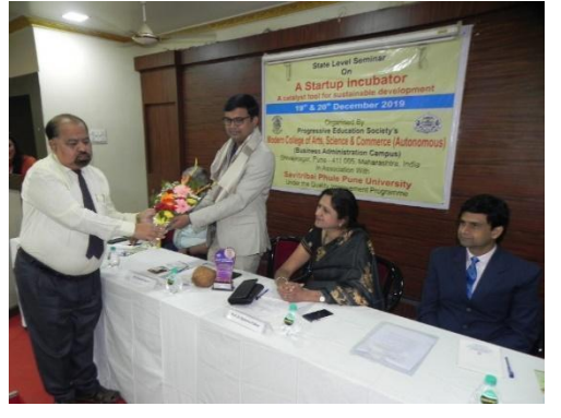
Study Visit and State level seminar organized by the Department