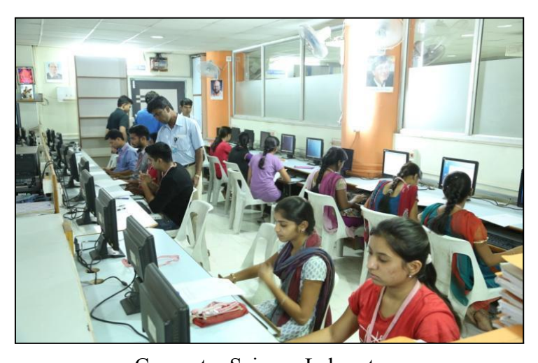
Computer Science Laboratory